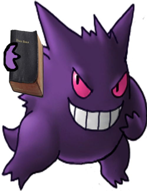
Authorities inform us that 'Purple Vest Ghost' may look something like this. Do not make eye contact lest he Dream-eat your dreams of wearing short skirts and sleeping in late!

As for purple vest guy, after a year hiatus ...see ZOMG Gengar on back